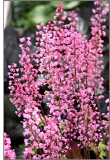
Dayglow Pink Foamy Bells flowers

Dayglow Pink Foamy Bells is a fine choice for the garden, but it is also a good selection for planting in outdoor pots and containers. It is often used as a 'filler' in the 'spiller-thriller-filler' container combination, providing a mass of flowers and foliage against which the larger thriller plants stand out. Note that when growing plants in outdoor containers and baskets, they may require more frequent waterings than they would in the yard or garden.