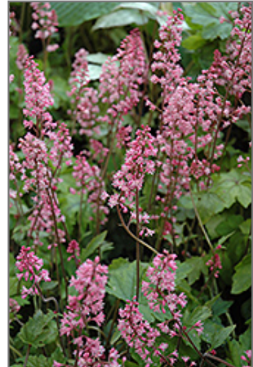
Dayglow Pink Foamy Bells flowers

This is a relatively low maintenance plant, and is best cleaned up in early spring before it resumes active growth for the season. It is a good choice for attracting hummingbirds to your yard. It has no significant negative characteristics.