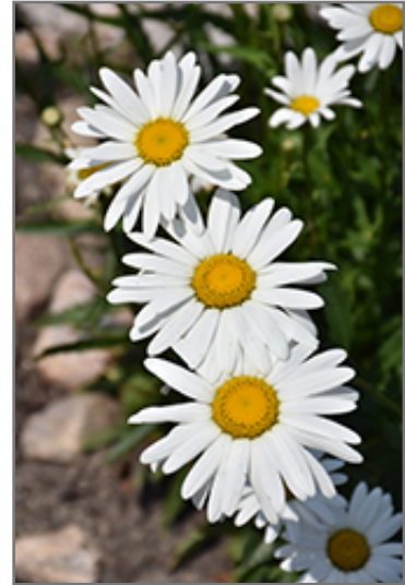
Silver Princess Shasta Daisy flowers