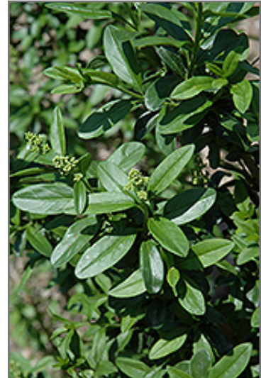
California Privet foliage