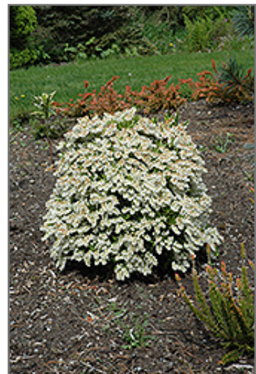
Prelude Japanese Pieris in bloom