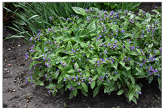
Dark Vader Lungwort in bloom