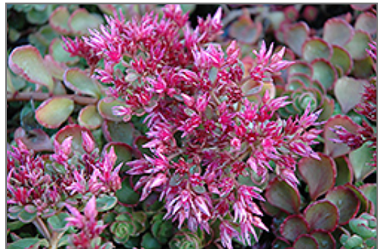
Fulda Glow Stonecrop flowers