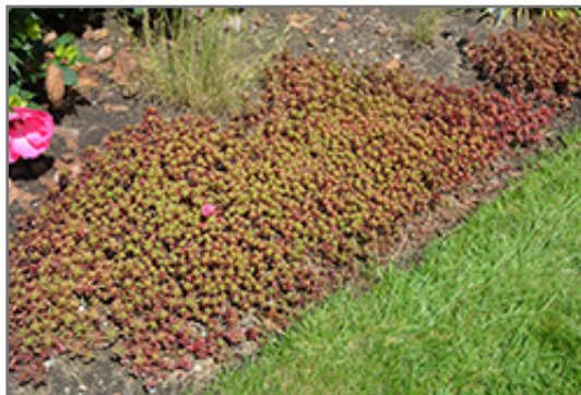
Fulda Glow Stonecrop

Fulda Glow Stonecrop is a fine choice for the garden, but it is also a good selection for planting in outdoor pots and containers. Because of its spreading habit of growth, it is ideally suited for use as a 'spiller' in the 'spiller-thriller-filler' container combination; plant it near the edges where it can spill gracefully over the pot. Note that when growing plants in outdoor containers and baskets, they may require more frequent waterings than they would in the yard or garden.