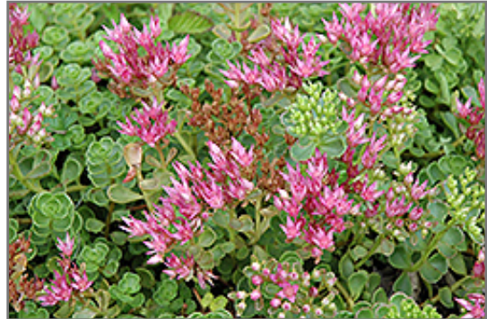
John Creech Stonecrop flowers

John Creech Stonecrop is recommended for the following landscape applications;