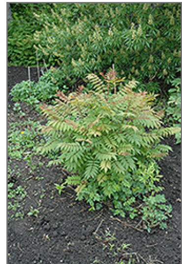
Sem False Spirea