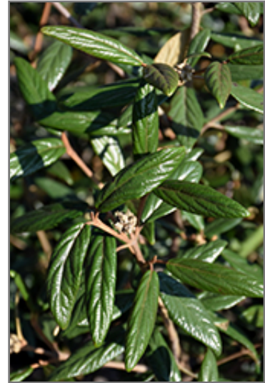
Prague Viburnum foliage

This shrub does best in full sun to partial shade. It prefers to grow in average to moist conditions, and shouldn't be allowed to dry out. It is not particular as to soil type or pH. It is highly tolerant of urban pollution and will even thrive in inner city environments. This particular variety is an interspecific hybrid.