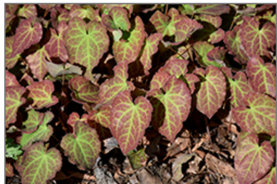
Froehnleiten Bishop's Hat foliage