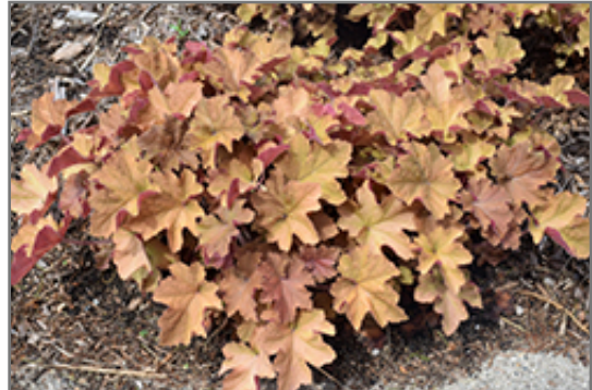
Caramel Coral Bells

Caramel Coral Bells is a fine choice for the garden, but it is also a good selection for planting in outdoor pots and containers. It is often used as a 'filler' in the 'spiller-thriller-filler' container combination, providing a mass of flowers and foliage against which the larger thriller plants stand out. Note that when growing plants in outdoor containers and baskets, they may require more frequent waterings than they would in the yard or garden.