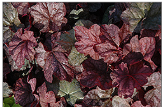
Beaujolais Hairy Alumroot foliage