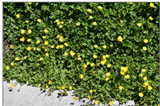
Barren Strawberry in bloom