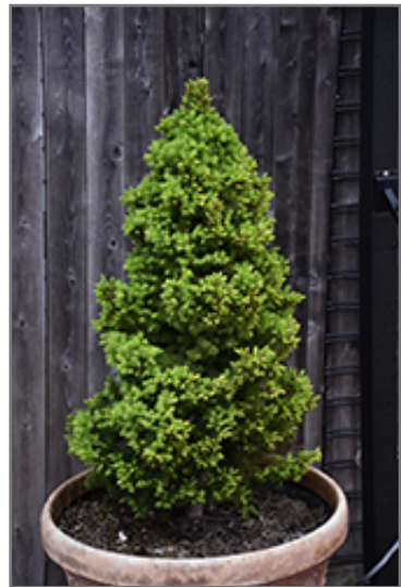
Rainbow's End Spruce