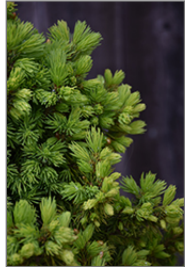
Rainbow's End Spruce foliage

This shrub should only be grown in full sunlight. It prefers to grow in average to moist conditions, and shouldn't be allowed to dry out. It is not particular as to soil type or pH. It is somewhat tolerant of urban pollution, and will benefit from being planted in a relatively sheltered location. This is a selection of a native North American species.