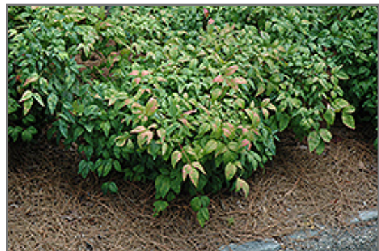
Fire Power Nandina