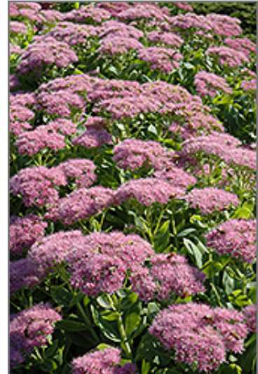
Brilliant Stonecrop flowers

Brilliant Stonecrop is recommended for the following landscape applications;