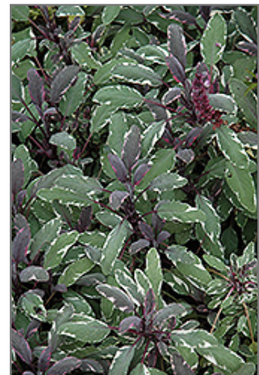
Tricolor Sage foliage