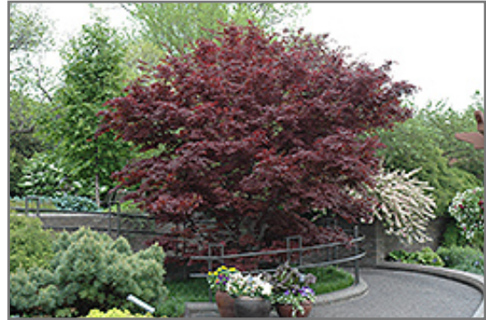
Bloodgood Japanese Maple

Bloodgood Japanese Maple is recommended for the following landscape applications;