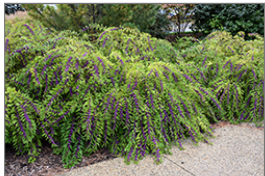
Issai Beautyberry fruit