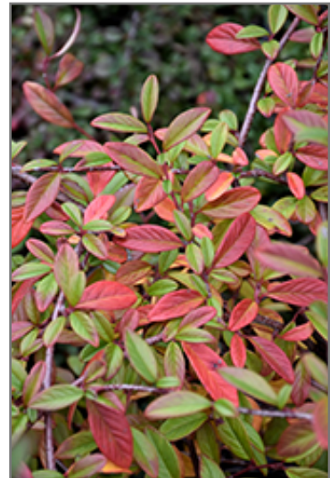
Scarlet Leader Willowleaf Cotoneaster in fall