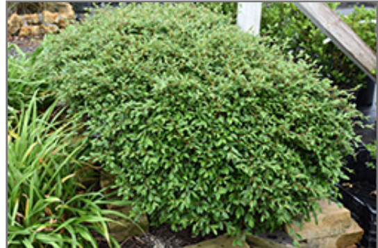
Scarlet Leader Willowleaf Cotoneaster

This shrub will require occasional maintenance and upkeep, and should not require much pruning, except when necessary, such as to remove dieback. It is a good choice for attracting birds to your yard, but is not particularly attractive to deer who tend to leave it alone in favor of tastier treats. Gardeners should be aware of the following characteristic(s) that may warrant special consideration;