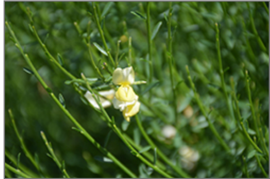
Moonlight Scotch Broom flowers

This shrub should only be grown in full sunlight. It prefers dry to average moisture levels with very well-drained soil, and will often die in standing water. It is considered to be drought-tolerant, and thus makes an ideal choice for xeriscaping or the moisture-conserving landscape. It is particular about its soil conditions, with a strong preference for clay, alkaline soils, and is able to handle environmental salt. It is highly tolerant of urban pollution and will even thrive in inner city environments. This is a selected variety of a species not originally from North America.