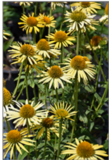
Maui Sunshine Coneflower flowers