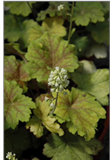
Electra Coral Bells flowers

Electra Coral Bells is recommended for the following landscape applications;