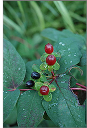
Albury Purple St. John's Wort fruit

Albury Purple St. John's Wort makes a fine choice for the outdoor landscape, but it is also well-suited for use in outdoor pots and containers. With its upright habit of growth, it is best suited for use as a 'thriller' in the 'spiller-thriller-filler' container combination; plant it near the center of the pot, surrounded by smaller plants and those that spill over the edges. It is even sizeable enough that it can be grown alone in a suitable container. Note that when grown in a container, it may not perform exactly as indicated on the tag - this is to be expected. Also note that when growing plants in outdoor containers and baskets, they may require more frequent waterings than they would in the yard or garden.