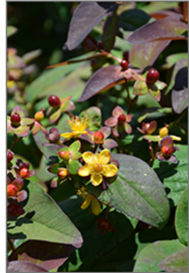
Albury Purple St. John's Wort flowers

Albury Purple St. John's Wort is recommended for the following landscape applications;