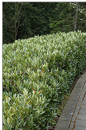
Otto Luyken Dwarf Cherry Laurel in bloom