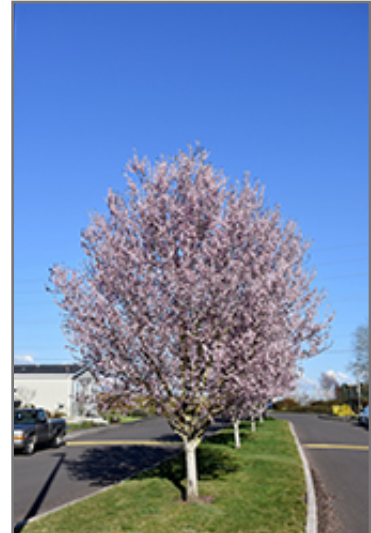
Krauter Vesuvius Plum in bloom

This tree will require occasional maintenance and upkeep, and is best pruned in late winter once the threat of extreme cold has passed. It is a good choice for attracting birds to your yard. Gardeners should be aware of the following characteristic(s) that may warrant special consideration;