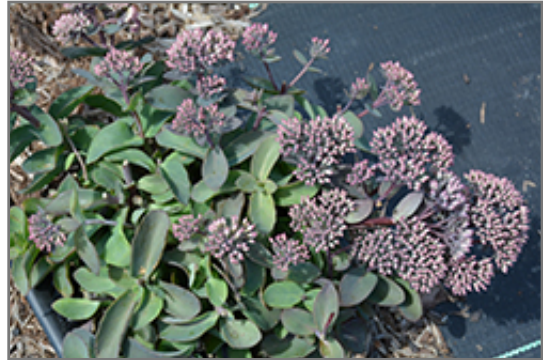
Chocolate Drop Stonecrop flower buds