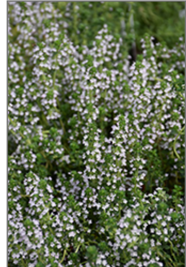
Doone Valley Thyme flowers

Doone Valley Thyme is a dense herbaceous evergreen perennial with a ground-hugging habit of growth. It brings an extremely fine and delicate texture to the garden composition and should be used to full effect.