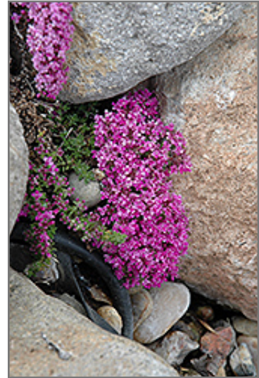
Pink Chintz Creeping Thyme in bloom

This plant should only be grown in full sunlight. It prefers to grow in average to dry locations, and dislikes excessive moisture. It is considered to be drought-tolerant, and thus makes an ideal choice for a low-water garden or xeriscape application. It is not particular as to soil type or pH. It is highly tolerant of urban pollution and will even thrive in inner city environments. Consider covering it with a thick layer of mulch in winter to protect it in exposed locations or colder microclimates. This is a selected variety of a species not originally from North America. It can be propagated by division; however, as a cultivated variety, be aware that it may be subject to certain restrictions or prohibitions on propagation.