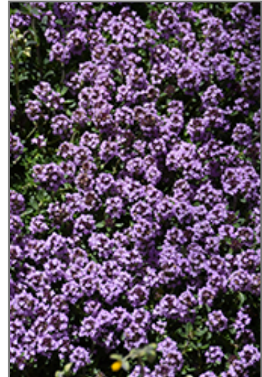
Pink Chintz Creeping Thyme flowers