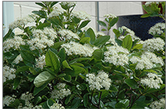
Winterthur Viburnum flowers

Winterthur Viburnum is a dense multi-stemmed deciduous shrub with an upright spreading habit of growth. Its average texture blends into the landscape, but can be balanced by one or two finer or coarser trees or shrubs for an effective composition.