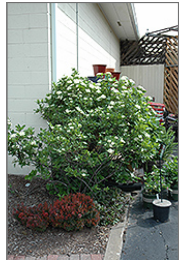
Winterthur Viburnum in bloom