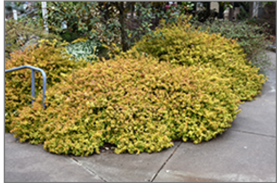
Kaleidoscope Abelia

Kaleidoscope Abelia will grow to be about 30 inches tall at maturity, with a spread of 4 feet. It tends to fill out right to the ground and therefore doesn't necessarily require facer plants in front. It grows at a slow rate, and under ideal conditions can be expected to live for approximately 30 years.