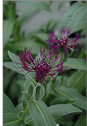
Amethyst Dream Cornflower flowers

Amethyst Dream Cornflower is recommended for the following landscape applications;