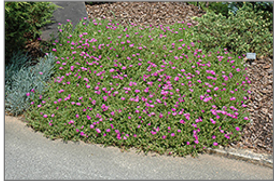
Purple Ice Plant in bloom

Purple Ice Plant is a fine choice for the garden, but it is also a good selection for planting in outdoor pots and containers. Because of its spreading habit of growth, it is ideally suited for use as a 'spiller' in the 'spiller-thriller-filler' container combination; plant it near the edges where it can spill gracefully over the pot. Note that when growing plants in outdoor containers and baskets, they may require more frequent waterings than they would in the yard or garden.