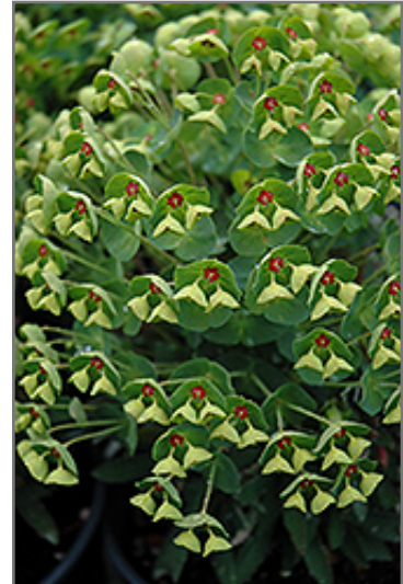
Tiny Tim Spurge flowers

Tiny Tim Spurge is recommended for the following landscape applications;