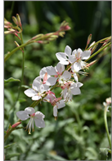
Whirling Butterflies Gaura flowers

Whirling Butterflies Gaura is an open herbaceous perennial with tall flower stalks held atop a low mound of foliage. It brings an extremely fine and delicate texture to the garden composition and should be used to full effect.