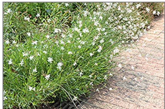
Whirling Butterflies Gaura in bloom