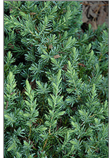
Blue Pacific Shore Juniper foliage