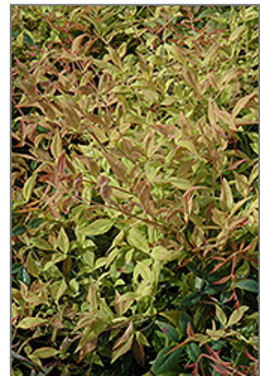
Gulf Stream Dwarf Nandina foliage