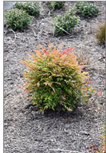
Gulf Stream Dwarf Nandina