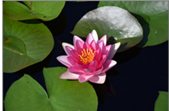
Attraction Hardy Water Lily flowers

Attraction Hardy Water Lily is ideally suited for growing in a pond, water garden or patio water container, and is recommended for the following landscape applications;