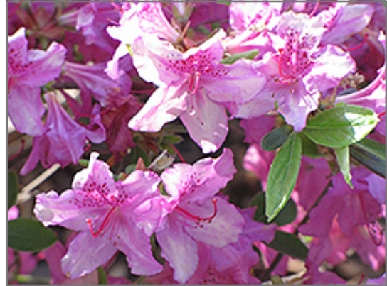
Girard's Karen Azalea flowers