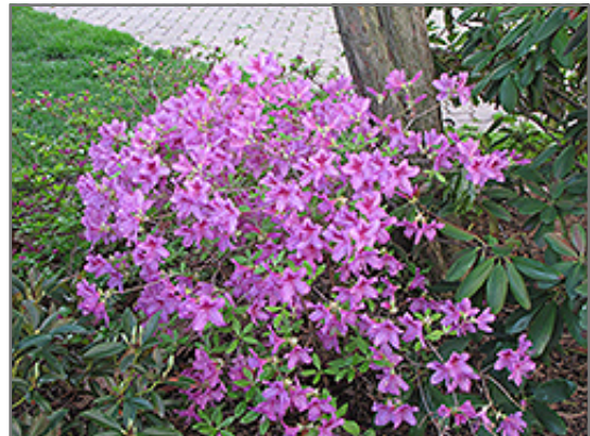
Girard's Karen Azalea in bloom