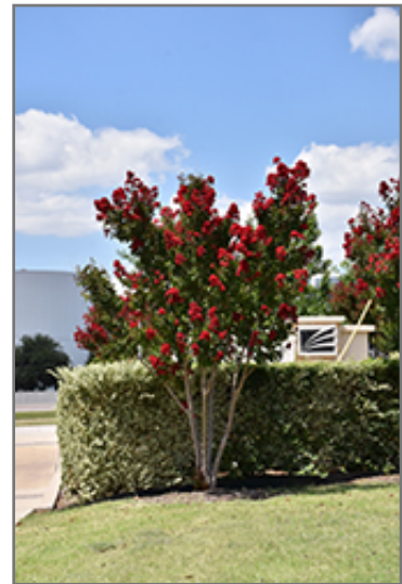
Dynamite Crapemyrtle in bloom