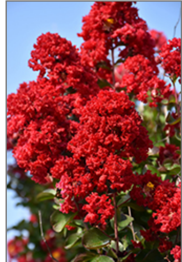
Dynamite Crapemyrtle flowers