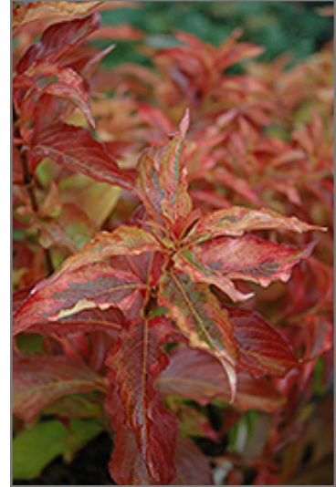
My Monet Sunset Weigela in fall

My Monet Sunset Weigela makes a fine choice for the outdoor landscape, but it is also well-suited for use in outdoor pots and containers. It is often used as a 'filler' in the 'spiller-thriller-filler' container combination, providing a mass of flowers and foliage against which the thriller plants stand out. Note that when grown in a container, it may not perform exactly as indicated on the tag - this is to be expected. Also note that when growing plants in outdoor containers and baskets, they may require more frequent waterings than they would in the yard or garden.