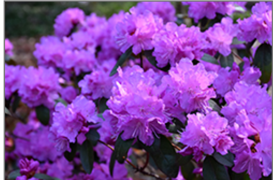
P.J.M. Elite Rhododendron flowers

P.J.M. Elite Rhododendron is recommended for the following landscape applications;