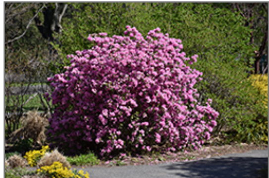
P.J.M. Elite Rhododendron in bloom