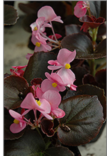
Cocktail Gin Begonia flowers