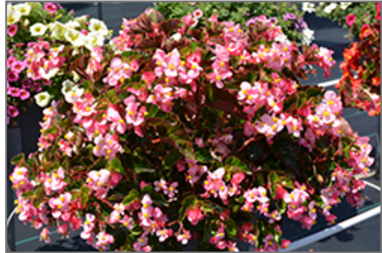
BabyWing Pink Begonia in bloom

BabyWing Pink Begonia is a fine choice for the garden, but it is also a good selection for planting in outdoor containers and hanging baskets. It is often used as a 'filler' in the 'spiller-thriller-filler' container combination, providing a mass of flowers and foliage against which the thriller plants stand out. Note that when growing plants in outdoor containers and baskets, they may require more frequent waterings than they would in the yard or garden.