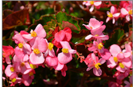
BabyWing Pink Begonia flowers

This is a high maintenance plant that will require regular care and upkeep, and usually looks its best without pruning, although it will tolerate pruning. Deer don't particularly care for this plant and will usually leave it alone in favor of tastier treats. Gardeners should be aware of the following characteristic(s) that may warrant special consideration;