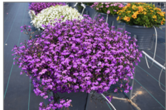
Techno Violet Lobelia in bloom