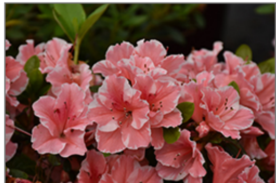
Encore Autumn Sunburst® Azalea flowers