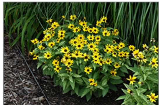
Sunburst False Sunflower in bloom