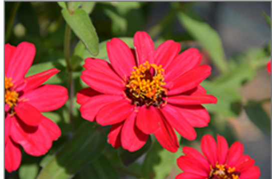
Profusion Double Hot Cherry Zinnia flowers

Profusion Double Hot Cherry Zinnia is recommended for the following landscape applications;