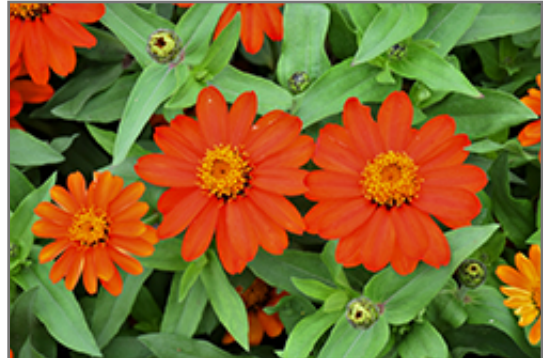
Zahara Fire Zinnia flowers

Zahara Fire Zinnia is recommended for the following landscape applications;