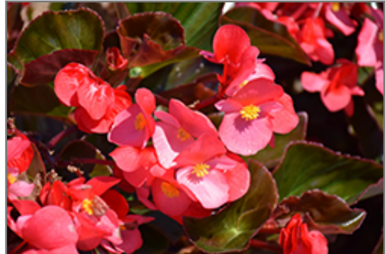
Whopper Rose Bronze Leaf Begonia flowers

This is a high maintenance plant that will require regular care and upkeep, and usually looks its best without pruning, although it will tolerate pruning. Deer don't particularly care for this plant and will usually leave it alone in favor of tastier treats. Gardeners should be aware of the following characteristic(s) that may warrant special consideration;